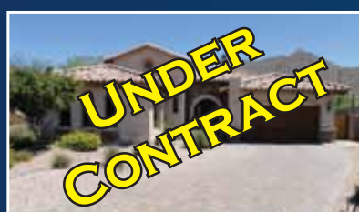
UNDER CONTRACT 2,883 sq. ft. 3BR, 3.5BA, 2G. Cul-de-sac lot, 2nd master suite, granite counters, Pebble Tec® pool & BBQ.