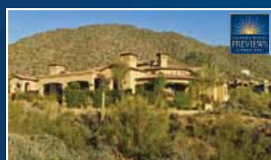
$3,300,000 7,179 sq. ft. 5BR, 5.5BA, 6G, 1.85 acre lot. City light & Mtn. views, granite counters, canterra columns.