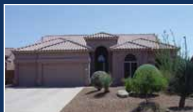
$429,000 2,827 sq. ft. 4BR, 2.5BA, 3G. Cul-de-sac lot, granite counters, stainless steel appliances & crown molding.