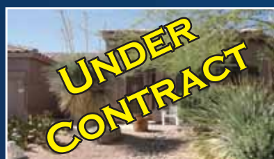
UNDER CONTRACT 2,226 sq. ft. 4BR, 2BA, 3G. Resort style backyard. built-in BBQ, Beehive firepit, flagstone. cul-de-sac.