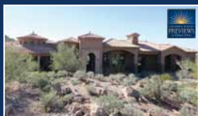
$1,250,000 4,026 sq. ft. 3BR, 3.5BA, 4G. Panoramic city light & Mtn. views, gourmet kitchen & negative edge pool.