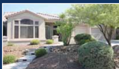
$475,000 3,330 sq. ft. 5BR, 3BA, 3G. Granite counters, mahogany cabinetetry, plantation shutters, pool & spa.