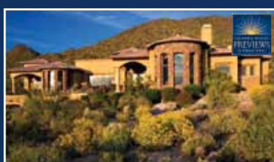
$1,600,000 6,189 sq. ft. 5BR, media room, 6BA, 4G. Gourmet kitchen, spectacular views, wine room, pool w/waterfall.