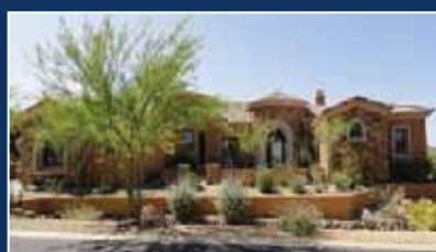
$1,400,000 7,346 sq. ft. 5BR, 4.5BA, 4G. Chiseled edge stone flooring, home theatre, pool & city light views.