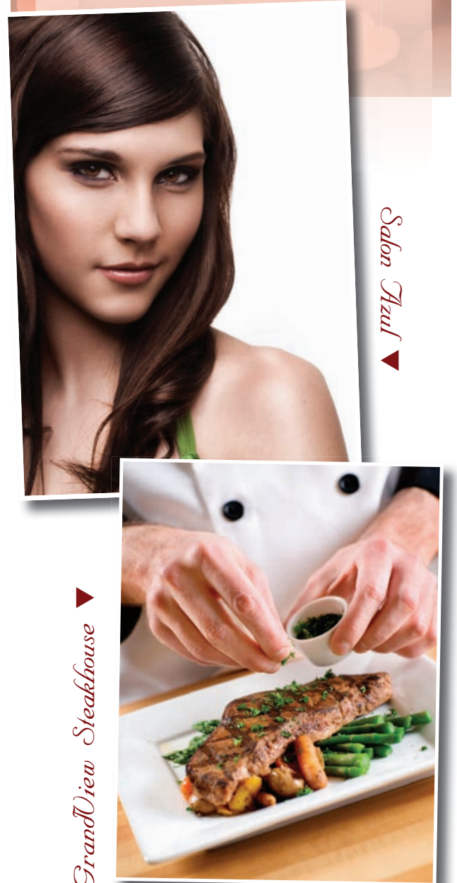
Salon Azul ▼

We hope this gift list helps you get started on planning the perfect day. Whatever you and your Valentine choose to do this year, we hope it's the most memorable yet. Happy Valentine's Day! ■