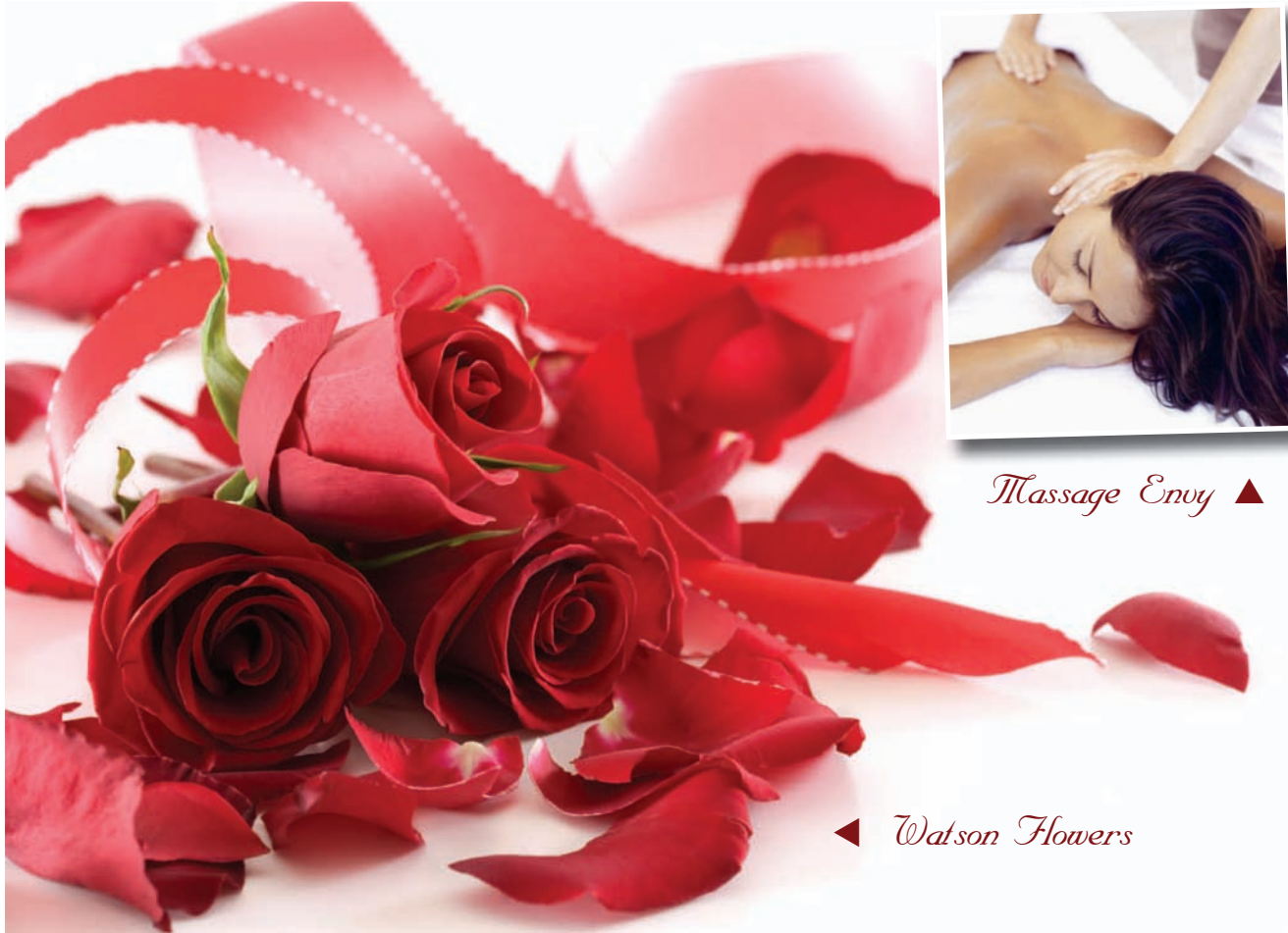
Massage Envy ▲